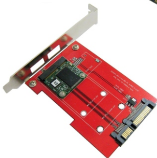
half size mSATA