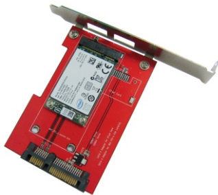
full size mSATA